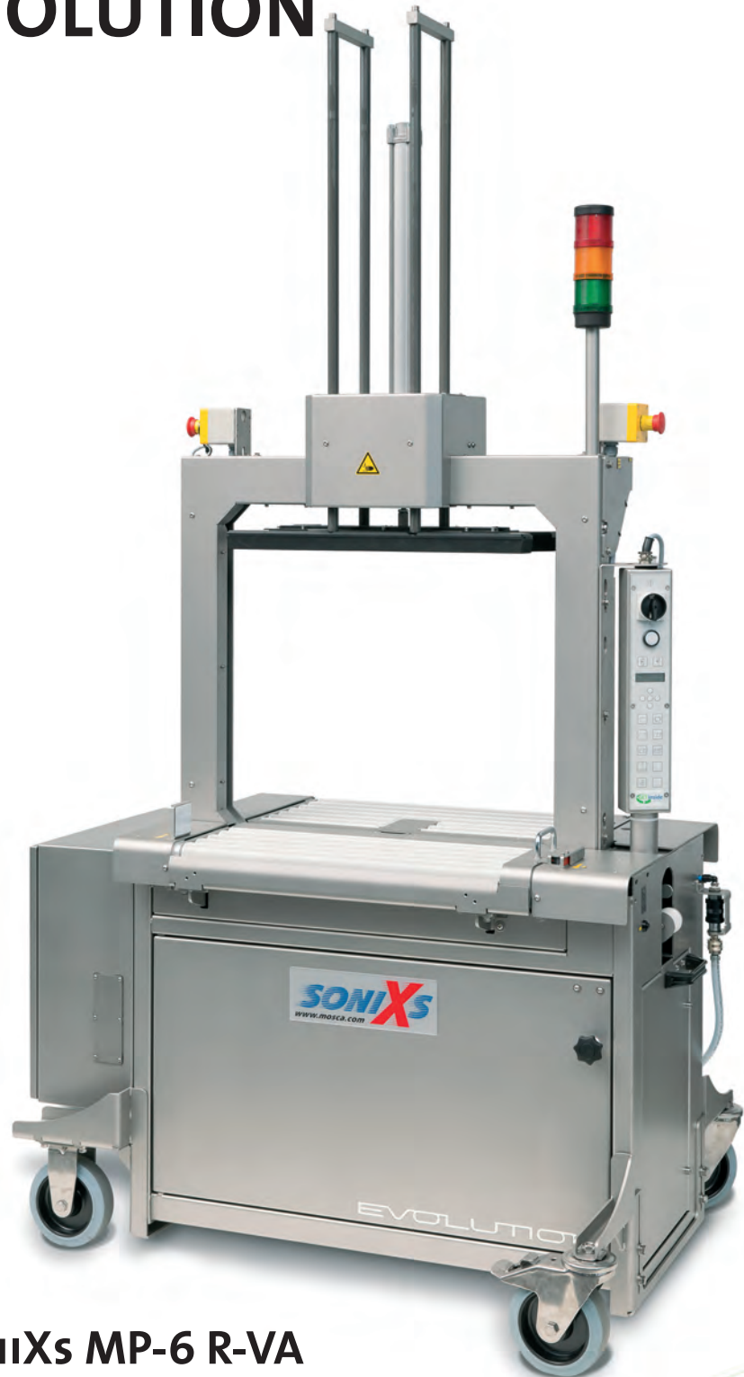
SONIXs MP-6 R-VA Fully Automatic Stainless Steel Strapping Machine