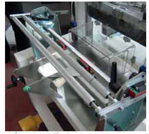
An adjustable tunnel allows the packaging of a Motorized Sealing Bar for different films. lot of different kind of products with wide range of measures.